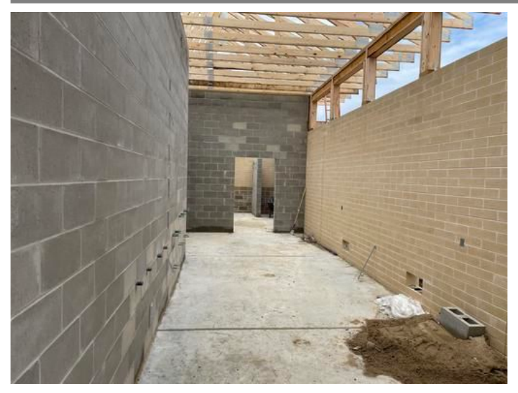
Installation of masonry walls at Bath House. Added on Sep 22, 2023, 9:36 AM CDT Added by andrew gordon