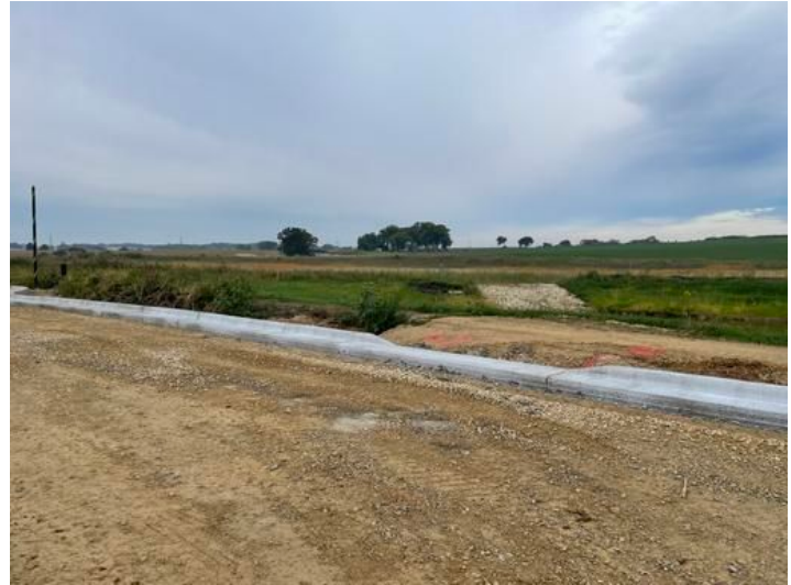
Installation of curb Added on Sep 22, 2023, 9:37 AM CDT Added by andrew gordon